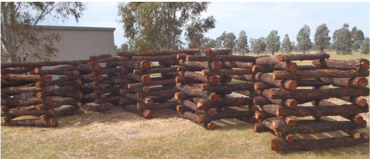
Wooden 'fish motels' of the type deployed into the Kerang lakes to increase fish habitat.

The effectiveness of installed habitat will be evaluated to determine whether it meets the desired objectives. Data will be collected from the recreational fishery in a cost-effective manner to inform the development of future habitat installation projects.