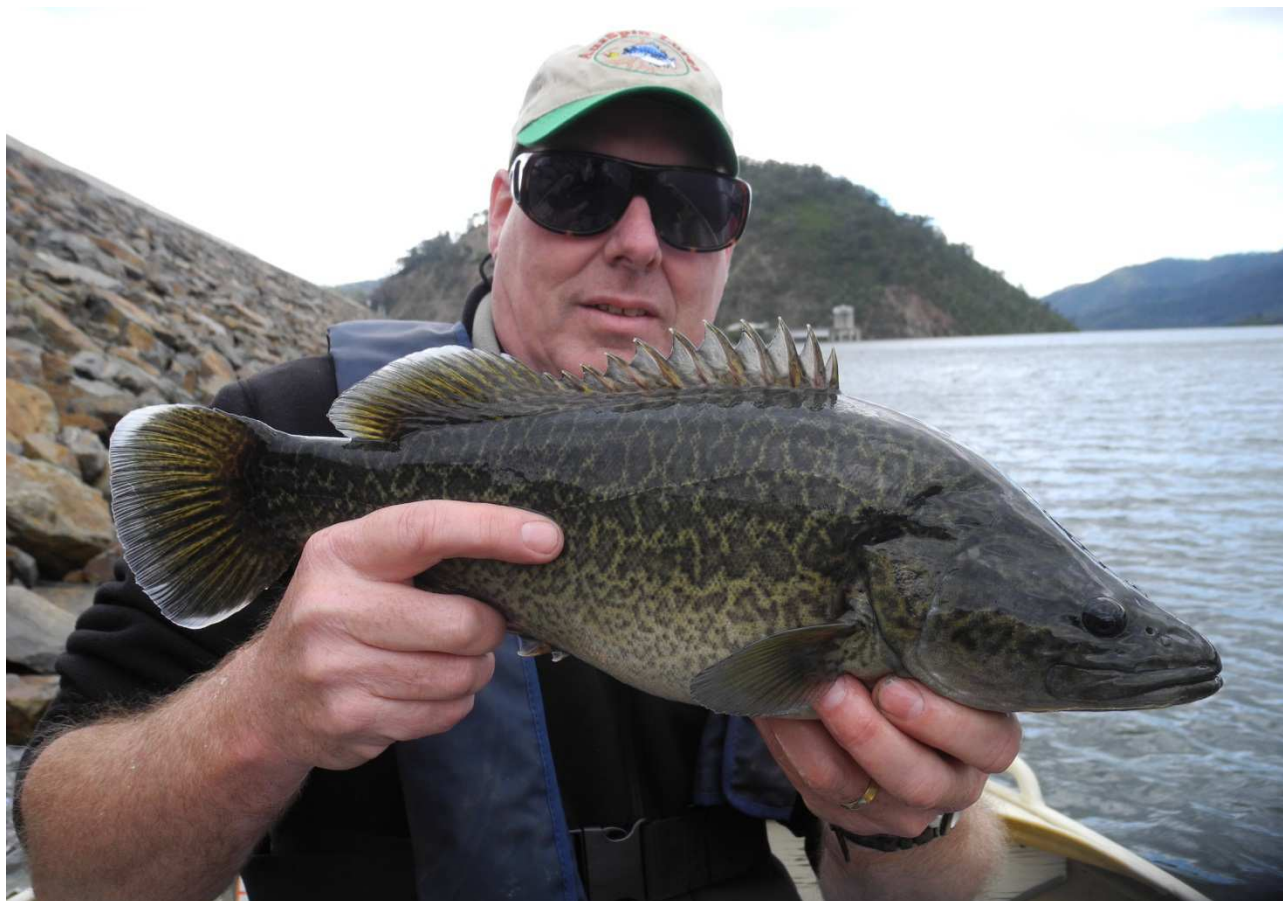
Anglers are reporting the capture of a growing number of juvenile cod from Lake Eildon. Research confirms that these fish were stocked as part of the Lake Eildon Million Murray cod project and it augurs well for the future fishery.

Fisheries Victoria conducted a program to boost Murray cod in Eildon Lake. The project, titled 'Murray Cod Million — Lake Eildon', released over one million Murray cod into the lake over the past three years. The stocking component of this work has ended and follow-up assessments have been completed to monitor the success of the stockings. A targeted angler interview creel survey was also completed to compare with one taken before the stockings proceeded. The project was supported through RFL funds. The final report will be included in the 'Monitoring fish stockings in Victoria: 2014 native fish surveys report' due for publishing late 2014.