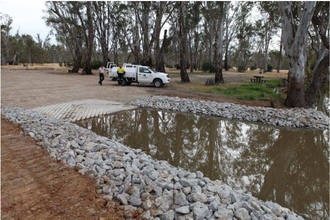
Recreational Fishing Initiative creating additional angler access Gunbower Creek boat ramp.