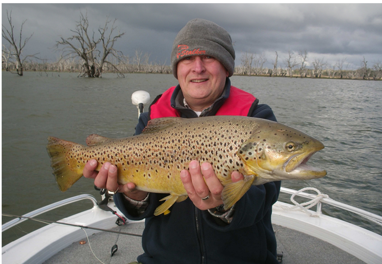
Lake Toolondo has been a standout trout fishery over 2014.