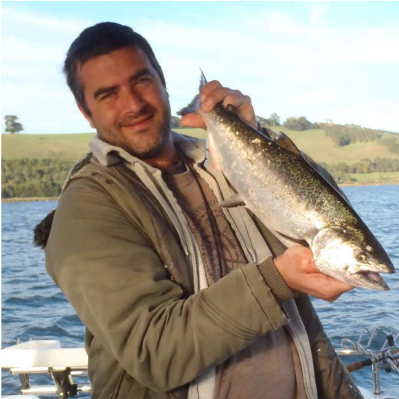
Chinook salmon to 3 kilograms in weight are being successfully targeted by anglers in Lakes Bullen Merri and Purrumbete.