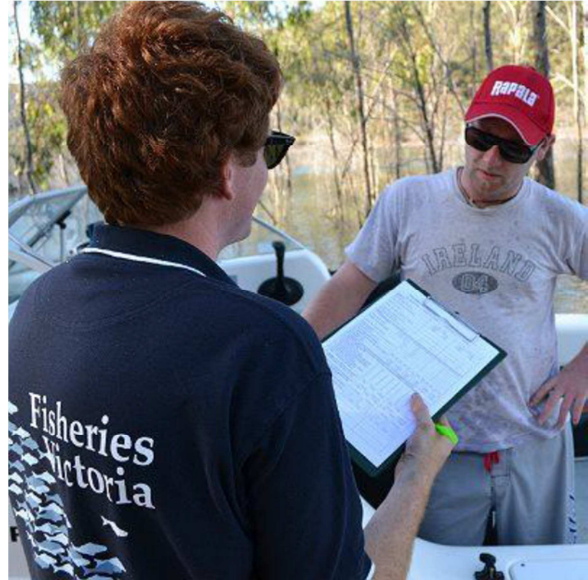
Creel surveys interview anglers in the field to collect catch and social data.