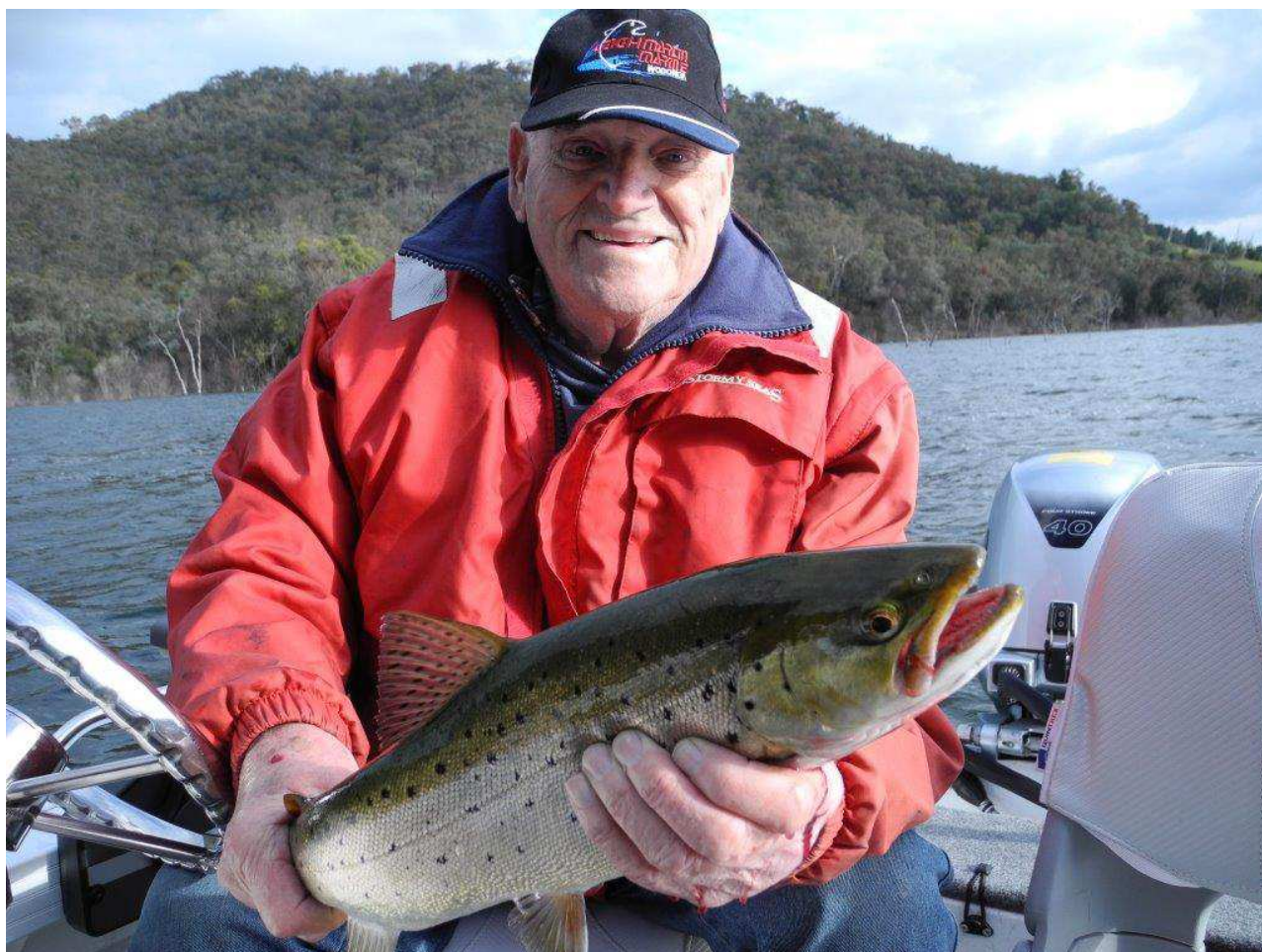
Quality recreational fishing makes happy anglers. Lake Eildon brown trout.

Funding from Recreational Fishing Licence (RFL) fees and the $16 million Recreational Fishing Initiative (RFI) has helped Fisheries Victoria stock over 2 million native fish into the lakes and rivers to improve freshwater fishing opportunities for anglers.