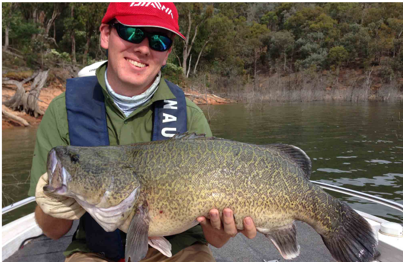
Lake Eildon developing as a Murray cod fishery.

Grampians/Barwon South West - held at Ballarat on the 27 th August 2013.