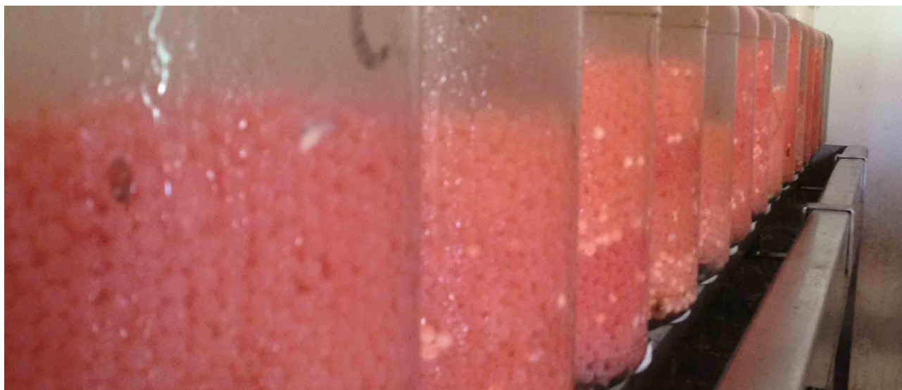
Chinook salmon eggs soon after fertilisation

Over the last 40 years, Chinook salmon have been bred at Snobs Creek and stocked into western district lakes where they have created exceptional trophy fisheries. At its peak, this fishery was one of the few land locked Chinook salmon fisheries in the world, generating extraordinary angler interest, participation and associated regional economic and social benefits.