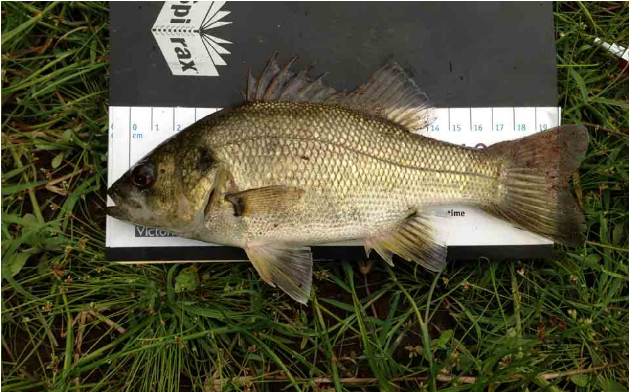
Bass stockings in Gippsland lakes and rivers are showing promise as developing fisheries.

The Australian bass stocking program is being extended to include the Tambo River and higher stocking numbers are planned for the Mitchell River and Blue Rock Lake.