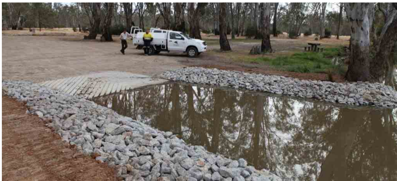
Recreational Fishing Initiative creating additional angler access Gunbower Creek boat ramp