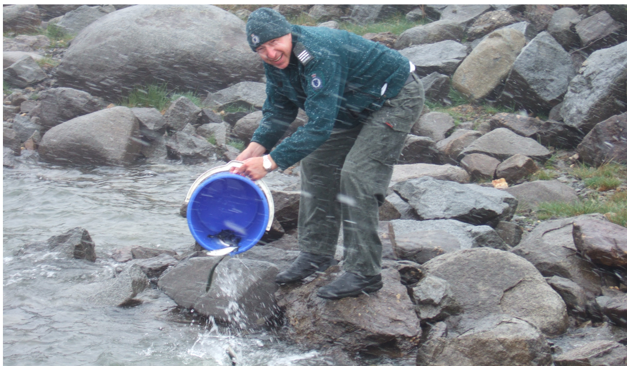
Chinook salmon release at Rock Valley Reservoir.

More information regarding the Chinook stocking program can be viewed at http://www.depi.vic.gov.au/fisheries/recreational-fishing/fish-stocking/chinook-salmon-stocking-returns .