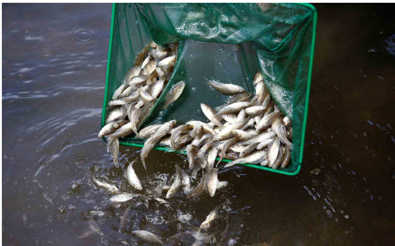
Macquarie perch fingerlings released into the Ovens River.