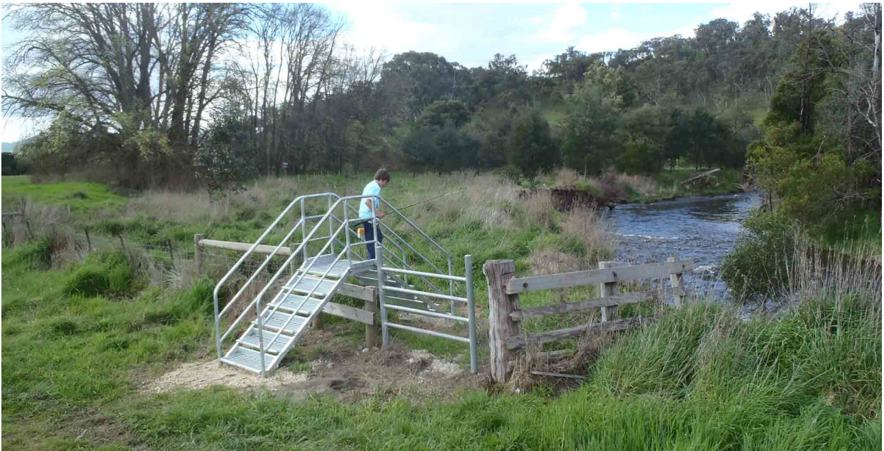
Angler access stile on Rubicon River.