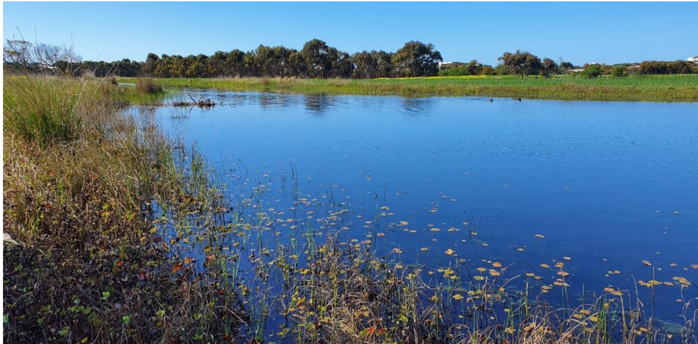
'Beyond Wetlands' surrogate site

Captive breeding and managed surrogate-site populations – develop enough stock to underpin regular, larger scaled translocations