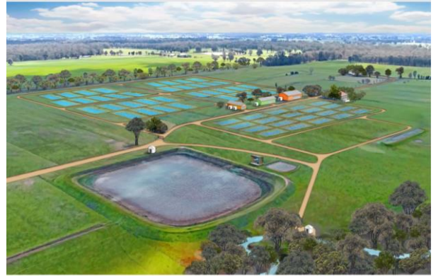
Stage 2 – VFA's Native Fish Hatchery (Arcadia)

Target One Million More Victorian Fish, more often.