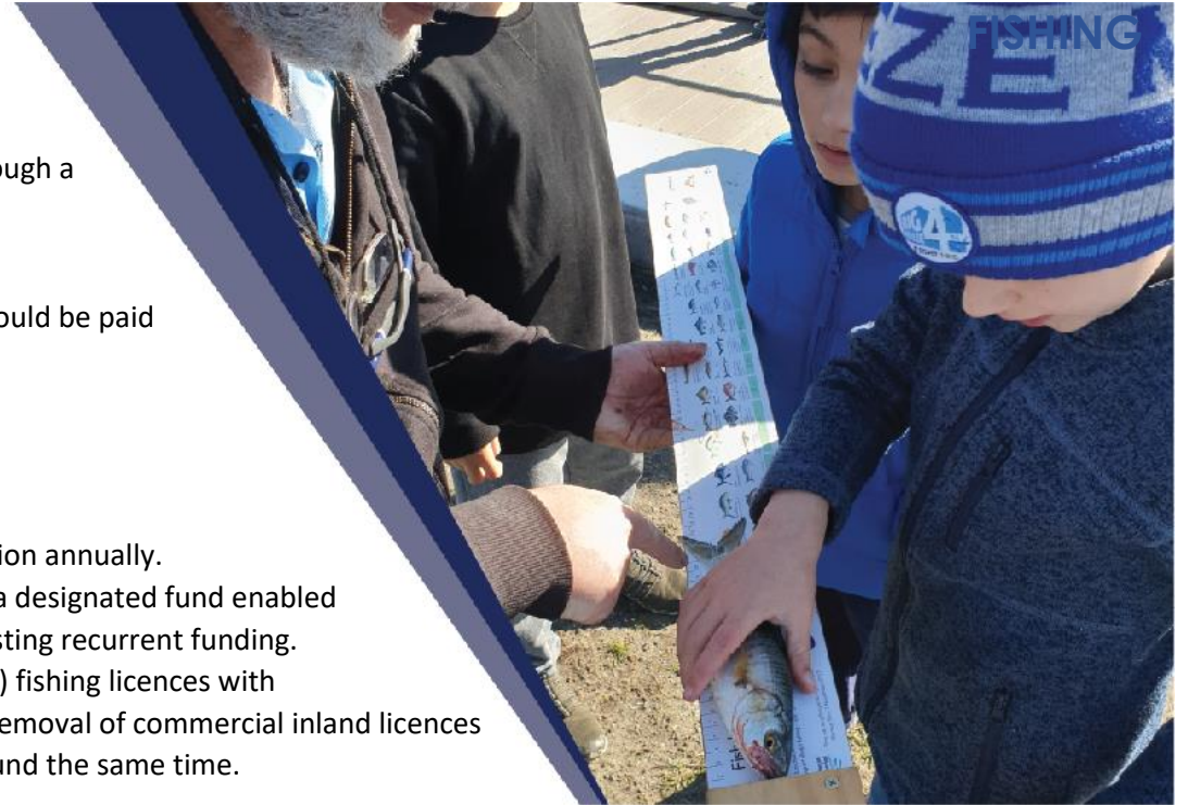
Photo: Fishcare Victoria – Creating Sustainable Anglers Project – Funded by RFL Large Grant

Over the years, the RFLTA has also funded government initiatives such as Target One Million, which includes stocking programs, access and facilities development of new fishing waters and more recently, sustainable habitat and revegetation projects.