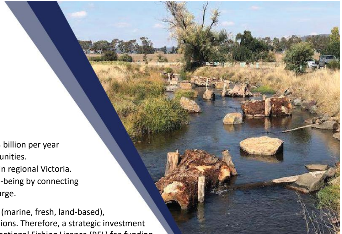
Photo: Delatite River Instream Restoration Project - ATF - Funded from Better Fishing Fund

For further information, please visit: https://vfa.vic.gov.au/recreational-fishing/fishing-licence/your-fishing-licence-fees-at-work