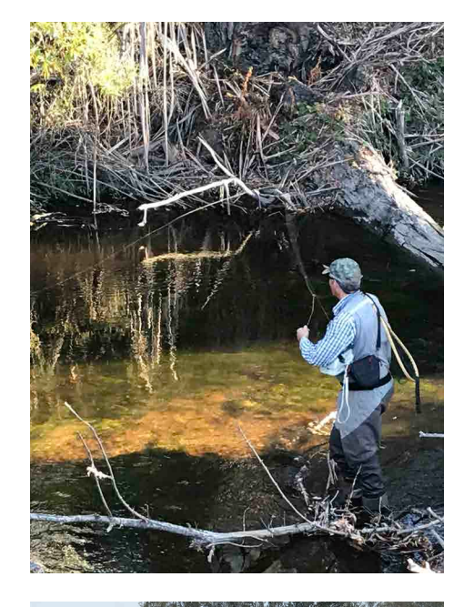
Top photo: Fishing in the Rubicon River