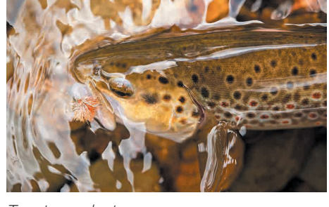
Top two photos: Thousands of trees and shrubs have been planted on stream-sides in "hands-on" exercises organised by the Australian Trout Foundation, CMA's, Angling Clubs and Landcare Groups