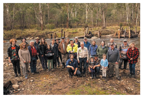
Top photo: Trout fisher, Ovens River Bottom photo: Buckland volunteer group

Photo on following page: Wild Trout Fishery workshop group