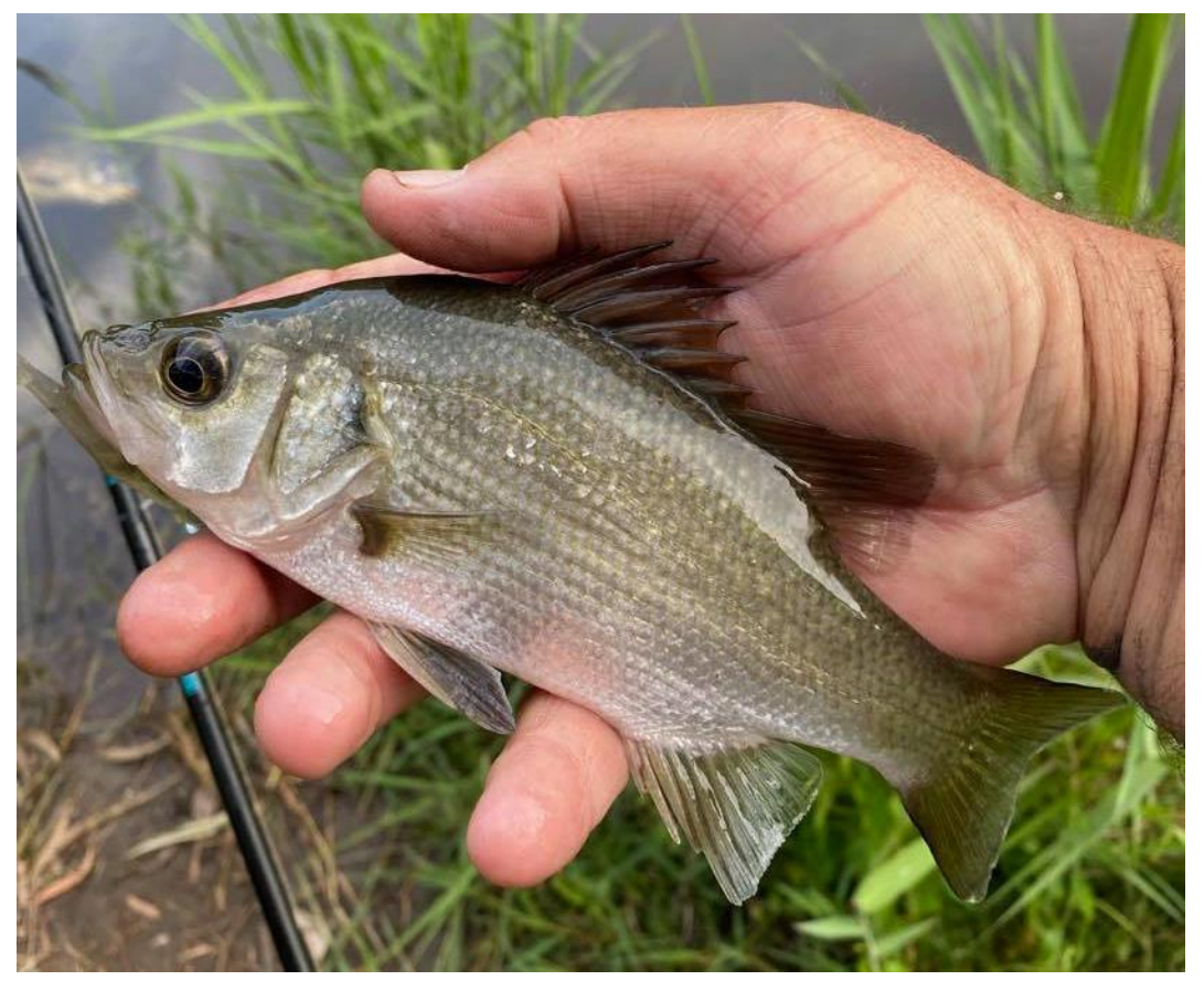
Our developing stocked estuary perch fisheries in the Maribyrnong and Barwon rivers are coming of age!

If you have any questions or comments about these or other projects, feel free to get in contact with the freshwater fisheries management team: