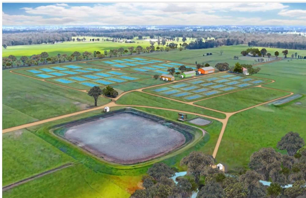
Stage 2 – VFA's Native Fish Hatchery (Arcadia)