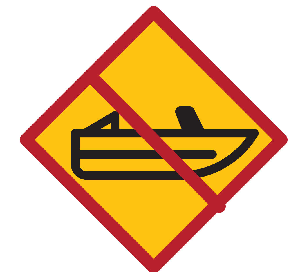
No on-water access