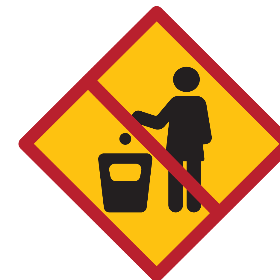
Please take rubbish with you