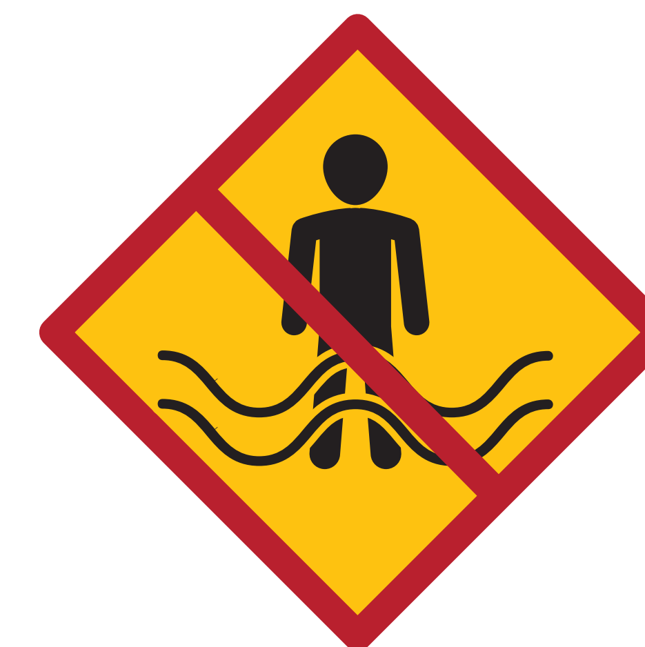
No wading or swimming