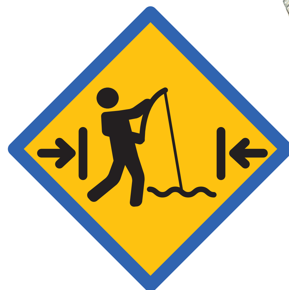
Stay within fishing area