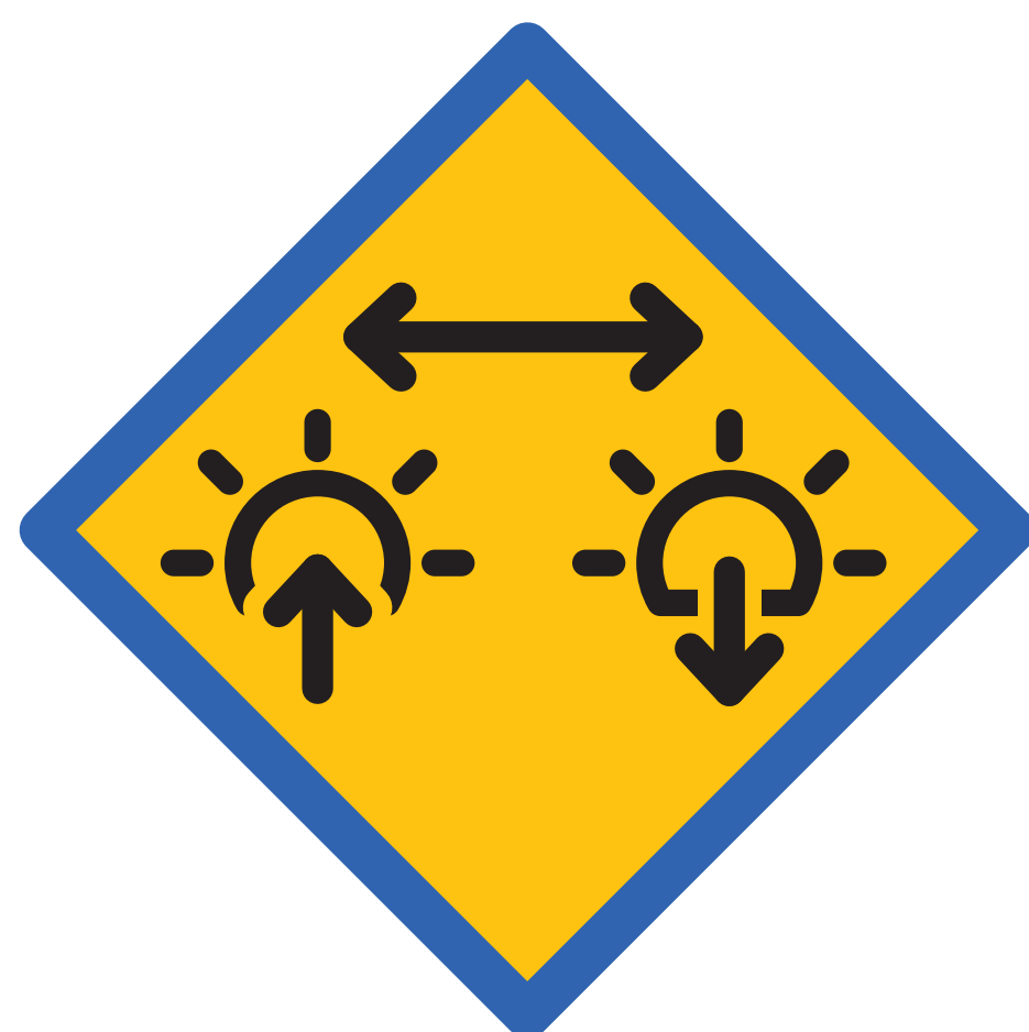
Fish only sunrise to sunset